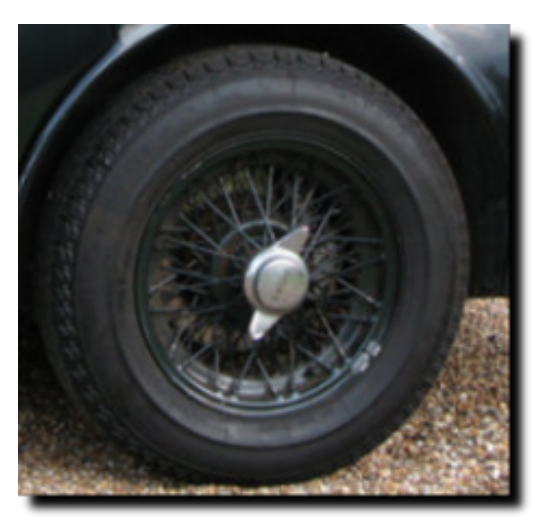
6. Wire wheel conversion