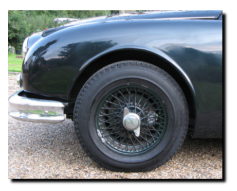
3 High rate front springs Cost £14 0s 0d