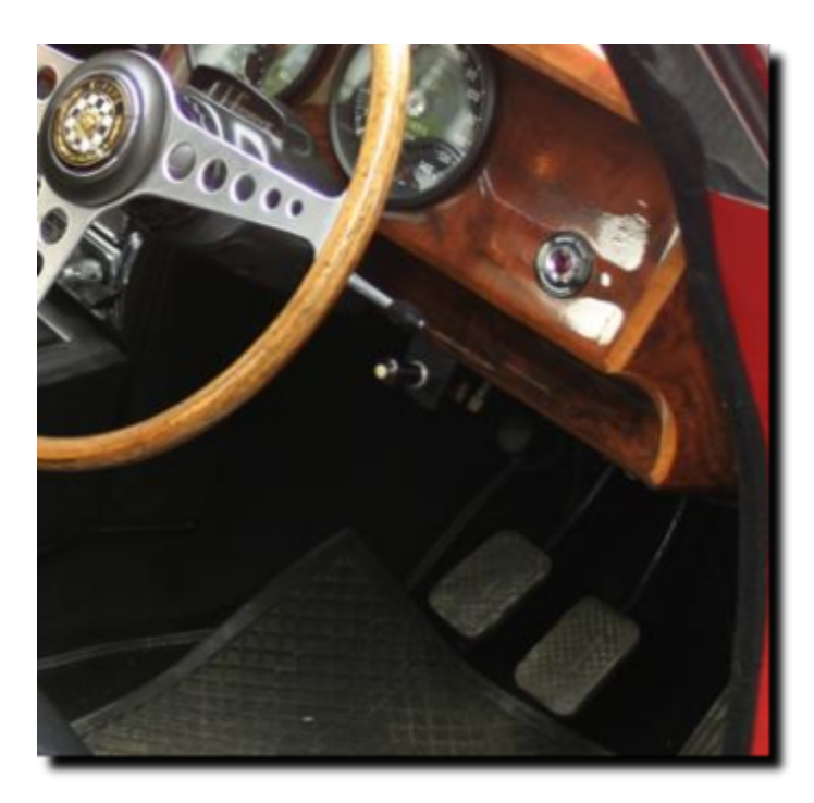
8. Manual controlled choke switch: Cost: £1 10s 0d