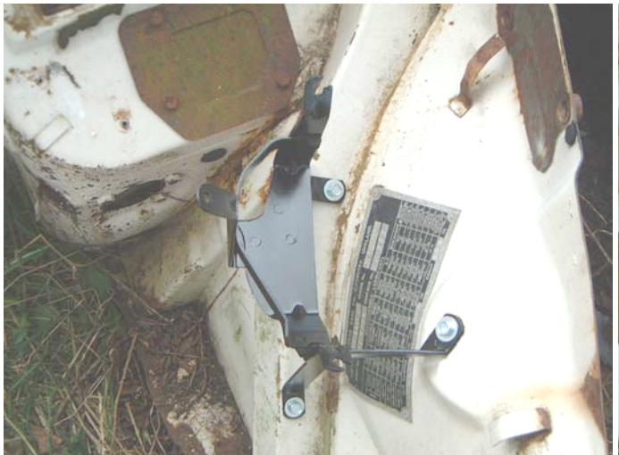
Fig 3. Fig 4

Fit the pump mounting bracket to nearside inner wing between the heater box and fuse panel as in photographs below, using supplied self tapping bolts (drill size 3/16" or 4.5mm). Use the round protrusion on the inner wing panel as a guide (as arrowed).