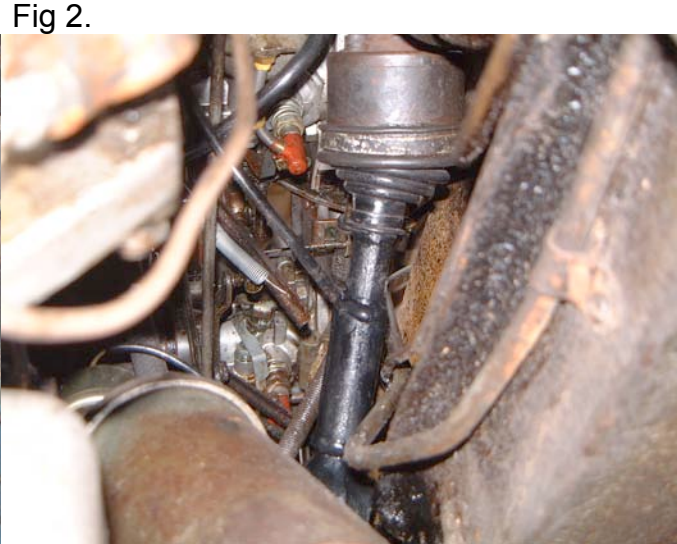
Lower steering column pictured from below

It is necessary to remove 3/8" (10 mm) from each end of the steering rack tie-bars before fitting track rod ends and locknuts. Fit feed and return steel pipes to steering rack pinion (forming the pipes to follow the steering rack across to left-hand side on RHD vehicles). Fit steering rack to brackets using the supplied 5/16" UNF x 2\frac{1}{2} " bolt's, washers and self-locking nuts. We have found through experience that when fitting the new track rod ends, wind on the locknuts and the track rod ends fully, then undo by 2 turns. Turn up the locknuts hand tight to the track rod ends and connect to the steering arms, fit self-locking nut and tighten.