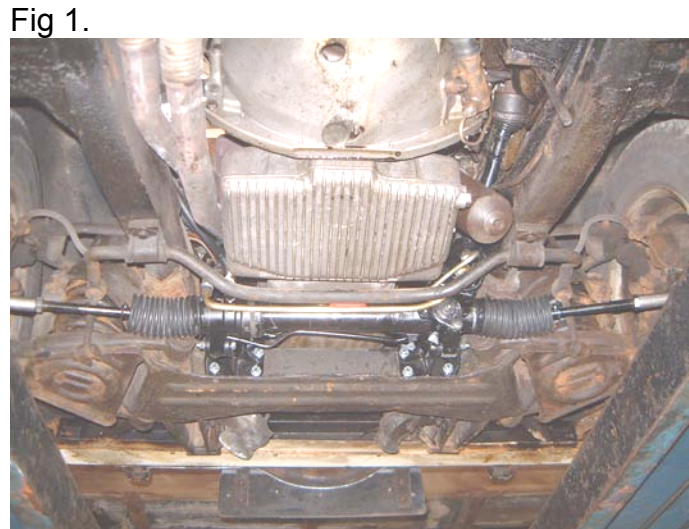
View looking up and forwards from underneath the car

Fit steering rack brackets using supplied 3/8" UNF x 1" setscrews, shake proof washers and plain washers to existing captive nuts in front cross-member, where the old steering box and idler were fitted.