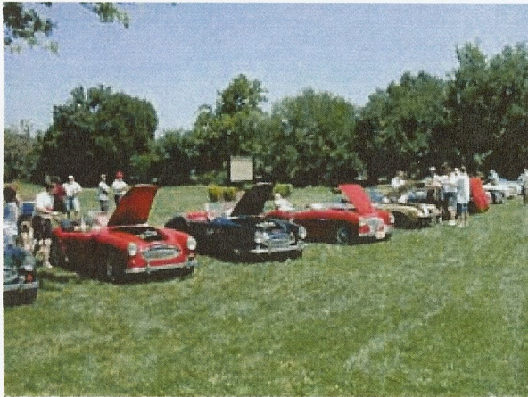
A fine lineup on the show field at Frederick High School.