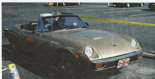
Yes, it's a Jensen Healey!